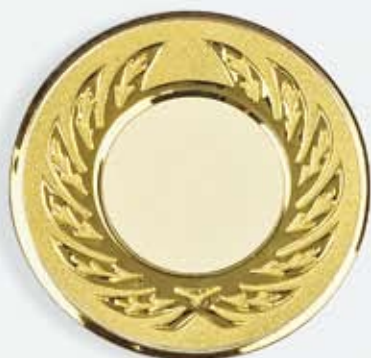
Ref. 213+Ref. 219